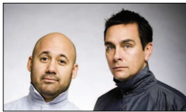
Comedy: The Skit Guys